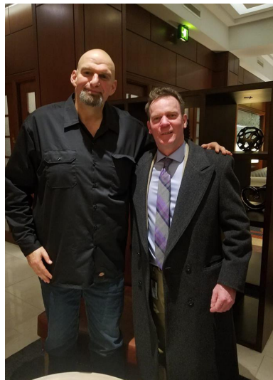
Lt. Governor Fetterman, Senator Laughlin